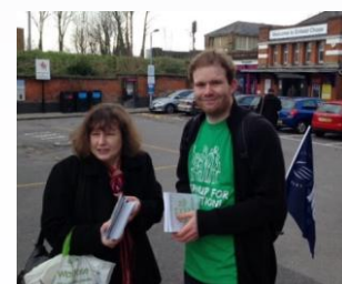
(Local NUT Members leafleting at the train stations in Enfield in July 2014)